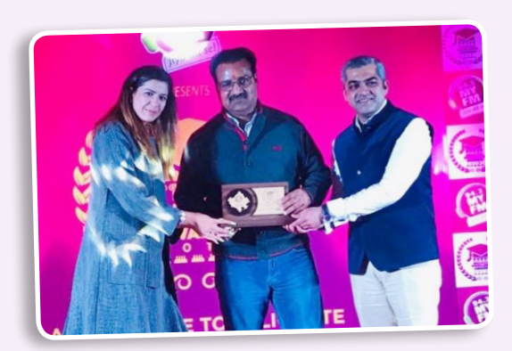
Education Excellence Award 2019 - Best Innovative Early Learning and Child Development Chain of Schools