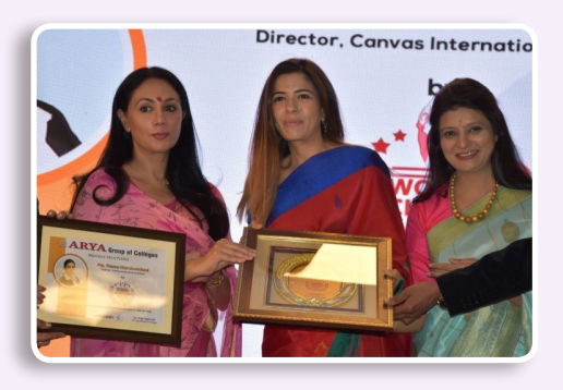
Women Achiever Awards 2019