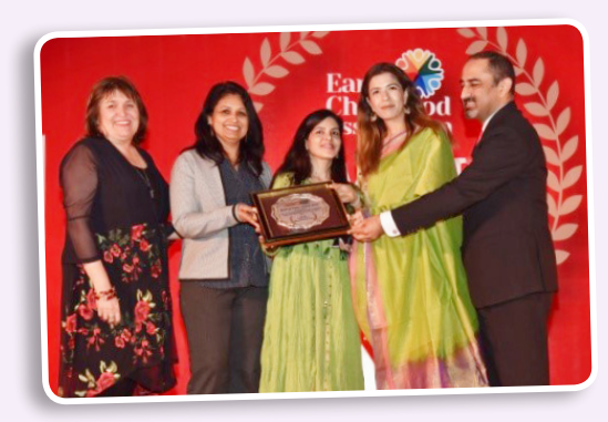
Awards- Top 50 Franchised Preschool in Asia - 2019