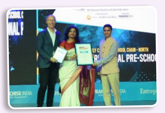
Indian Education Award 2019-Emerging Early Child Play School Chain (North)