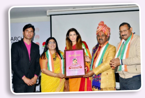
International Women Empowerment Honor 2019