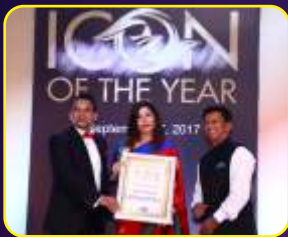
Icon of the Year Award, 2017